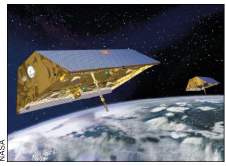
Twin GRACE satellites measure tiny variations in Earth's gravity from accelerations and decelerations along their orbits.

Global warming is changing the sea level on a global scale by melting ice and snow, but